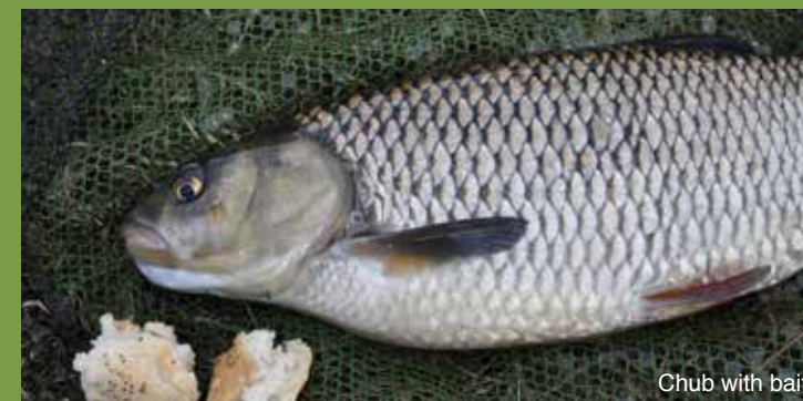
Chub with bait

Sheatfish and eel are totally protected. If you catch one put it back immediately.